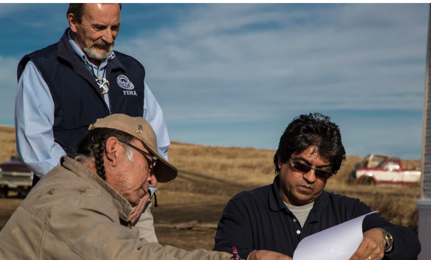
FEMA staff check final paperwork and title documents prior to the turnover of a FEMA Manufactured Housing Unit (MHU) for an Oglala Sioux Tribe member on the Pine Ridge Reservation.

As the emergency management environment shifts and changes, FEMA must remain flexible and adaptable with how it defines success. This includes soliciting and accepting stakeholder feedback on a regular basis. Consequently, each Strategic Objective describes what outcomes will be measured to assess progress. The Agency will consider potential challenges and risks to the Agency's strategy and success against the performance measures throughout the life of the 2018-2022 FEMA Strategic Plan. Ongoing refinement of FEMA's strategic direction over the next five years will ensure that FEMA is well positioned and adaptable to the future of emergency management and the risks we face as a Nation.