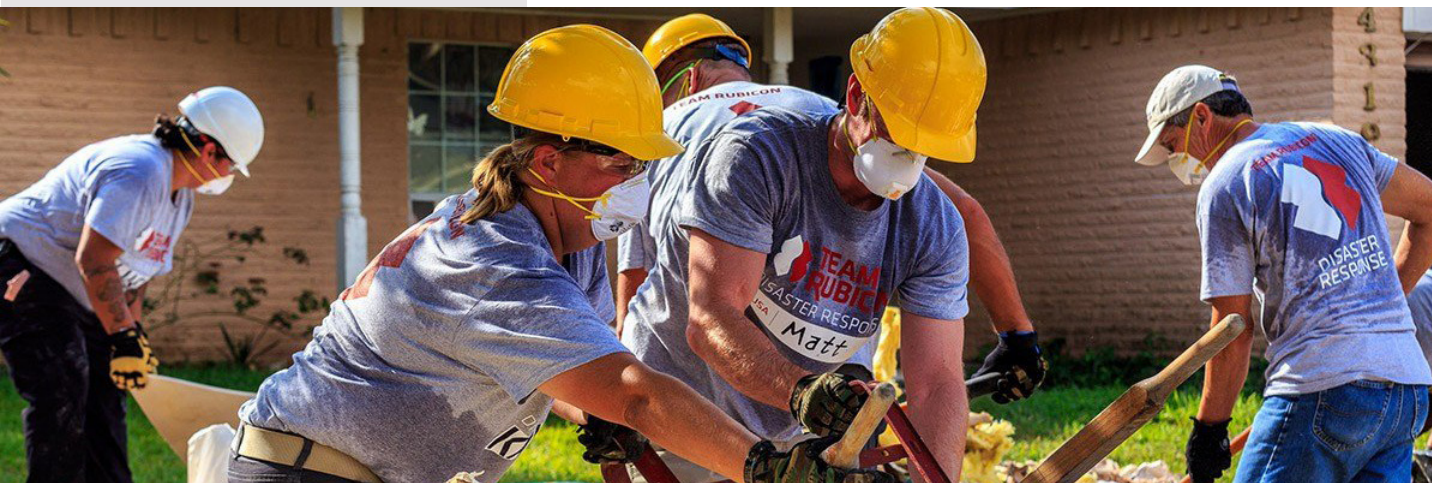
Team Rubicon works to help survivors in a neighborhood affected by Hurricane Harvey.

FEMA's role is to strategically stock the essential items needed to jumpstart a response, but effectively delivering resources in the face of a major disaster requires the continued development of robust partnerships and reliable