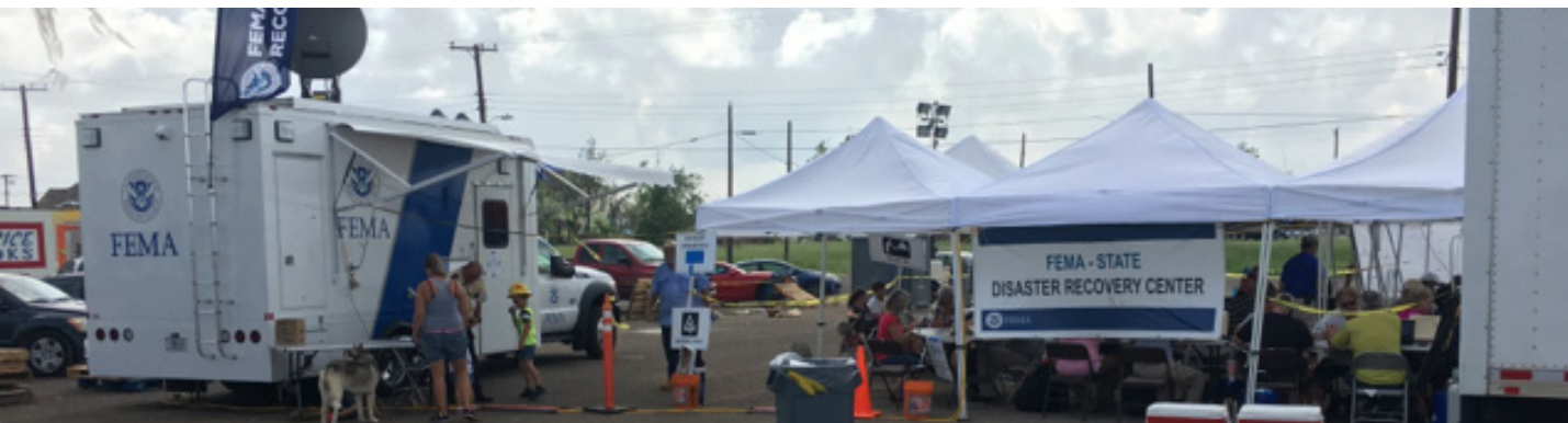
A FEMA-State Disaster Recovery Center is open for business in Texas.

Further, roles and responsibilities identified in the NDRF need to be clarified in practice. This includes maturing our understanding of the distinct roles of the Federal Disaster Recovery Coordinator, the Federal Coordinating Officer, and SLTT leadership, including Long-Term Recovery Managers. It is critical for leadership responsibilities and authorities to be clearly defined during active response and recovery operations and when multiple Federal agencies are involved. Clarity helps ensure integrated operations and coordination of Federal partner resources to support community recovery. It also enhances understanding of disaster complexities, community impacts, and opportunities for collaborative problem solving.