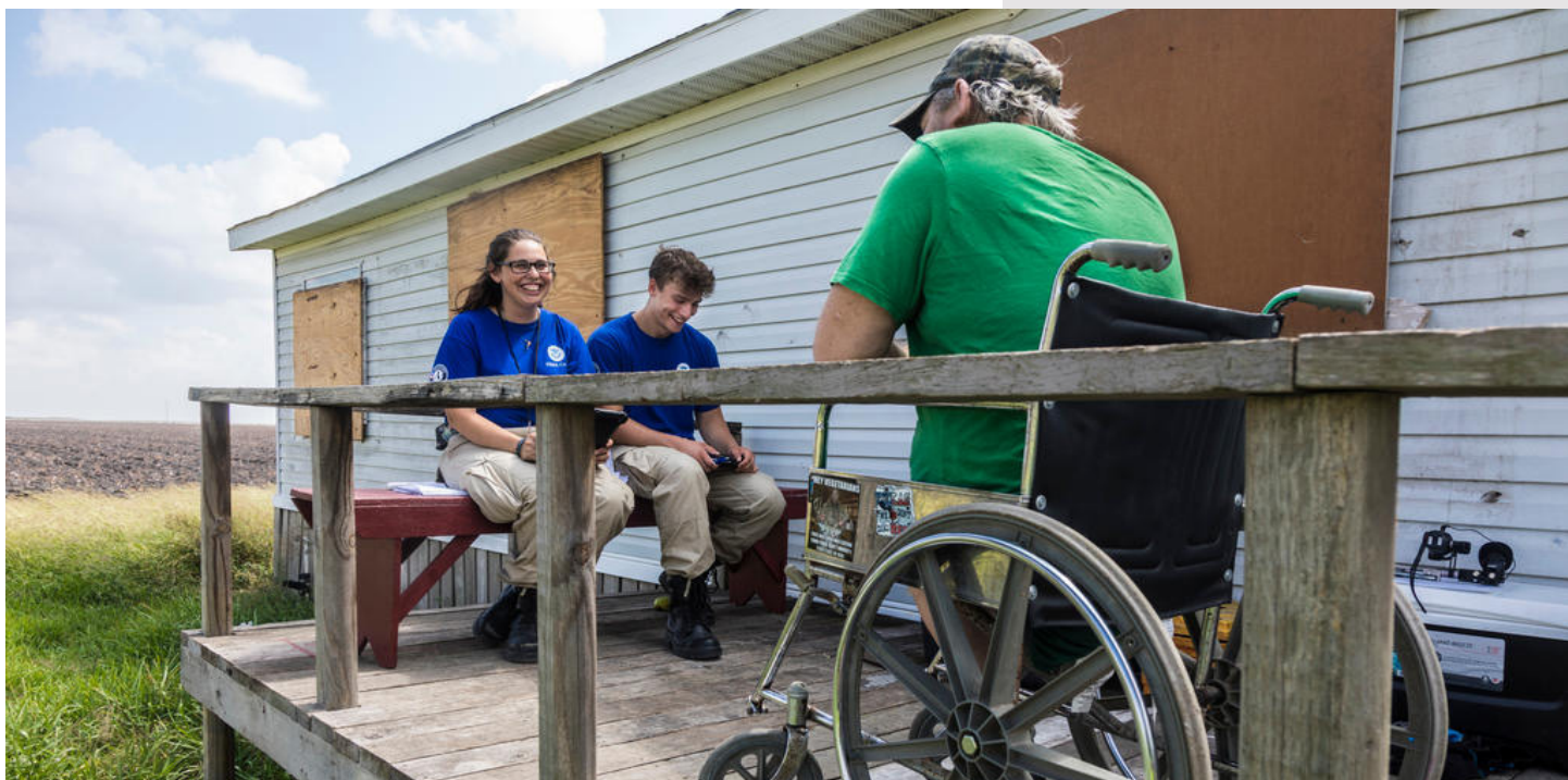
FEMA Corps Eagle 8 team members speak with a survivor in a rural part of Robstown, Texas after Hurricane Harvey.

Improving FEMA's analytics capabilities will enable the use of data-driven approaches to identify and address Agency-wide inefficiencies and risk.