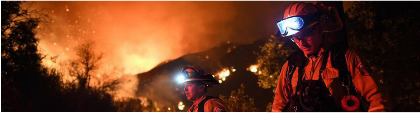
Two firefighters battle wildfires in California. FEMA played a significant role during California's 2017 wildfires.