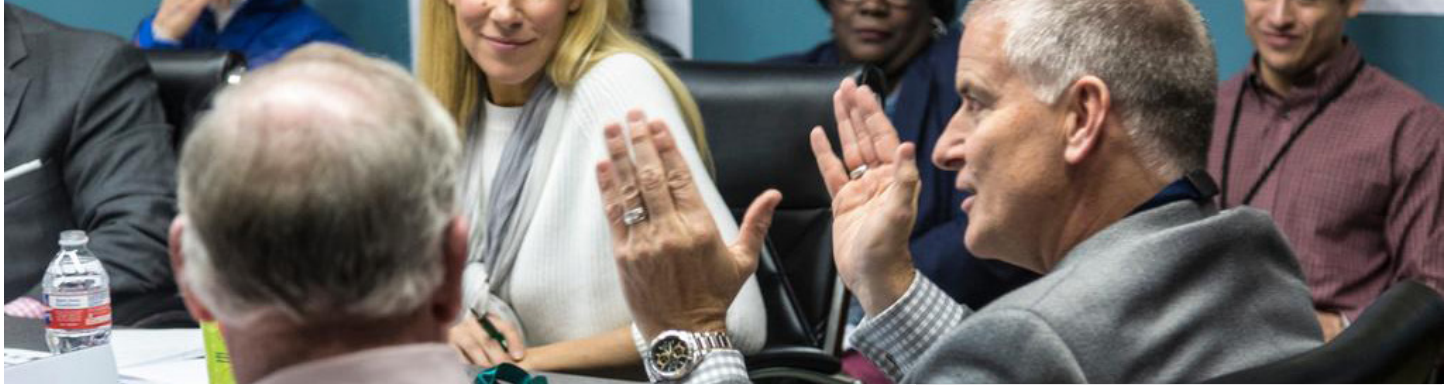
A FEMA staff member speaks at the Regional Interagency Coordination Recovery Meeting at the Joint Field Office (JFO) in Austin.