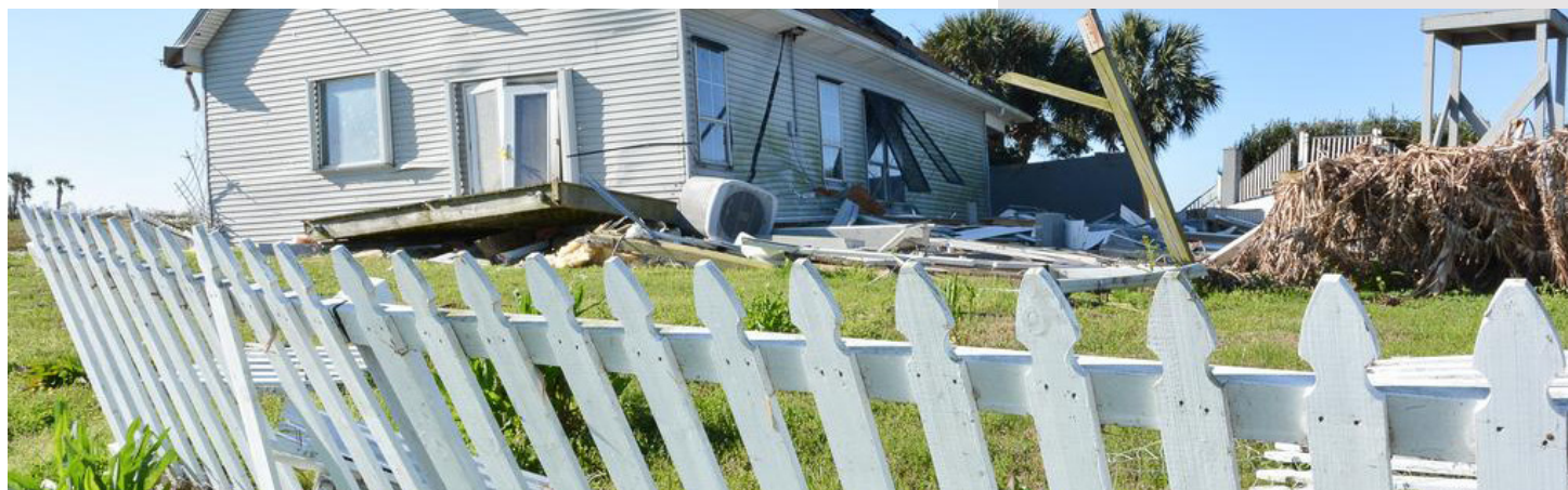
The effects of a tornado on a residential property in Madisonville, Louisiana. Property damage presents a significant challenge for survivors of catastrophic disasters.

Outreach presents an opportunity to learn from stakeholders with NDRF experience, better understand past challenges, and make improvements to how the NDRF is implemented moving forward.