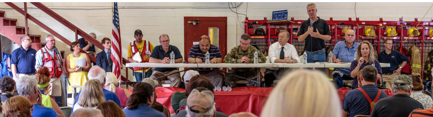
Flood survivors attend a community town hall meeting to ask questions about aid programs and recovery plans.

“The optimal framework for response and recovery is one that is Federally supported, state managed, and locally executed.”