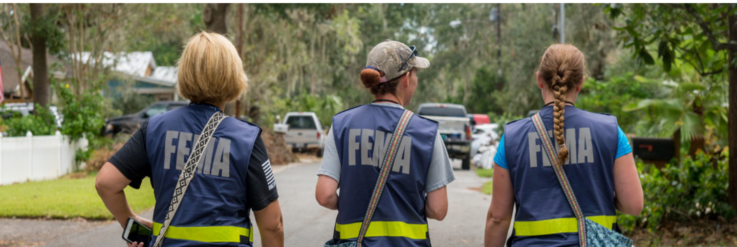
FEMA Disaster Survivor Assistance (DSA) team members canvass neighborhoods to ensure that residents are aware of FEMA assistance for damage from Hurricane Irma.

“Responding to and recovering from any disaster is a whole community effort that relies on the strength of Federal, state, local, tribal, and territorial governments, as well as non-governmental entities and individuals, in addition to FEMA.”