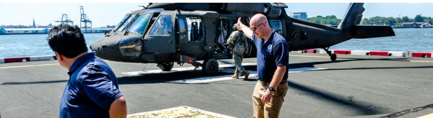
FEMA staff departing a military helicopter following an aerial assessment of Manhattan.