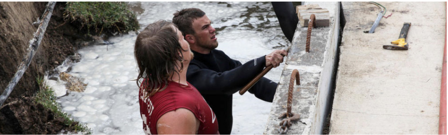
Hurricane Irma compromised about 12 miles of city owned seawalls in Punta Gorda, Florida. Two workers address the city's seawalls following the 2017 Hurricane Season.

Every $1 that the Federal Government invests in mitigation saves taxpayers an average of $6 in future spending.